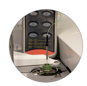
VKIT-1517 inlet probe