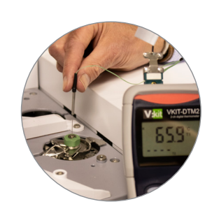
Simplifies testing of GC zones

DTM2 improves on the classic, proven VKIT-1531 design by adding a larger LCD display and improved connectivity via USB.