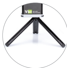
Integrated tripod stand