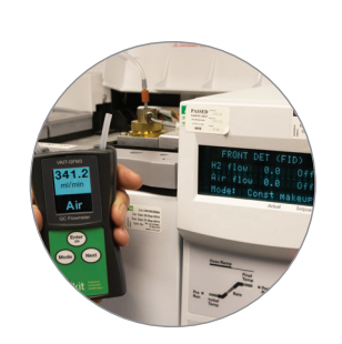
Simplifies measurement of GC flow zones